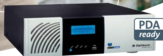
The new recorder from Dallmeier – DLS 6 PDA